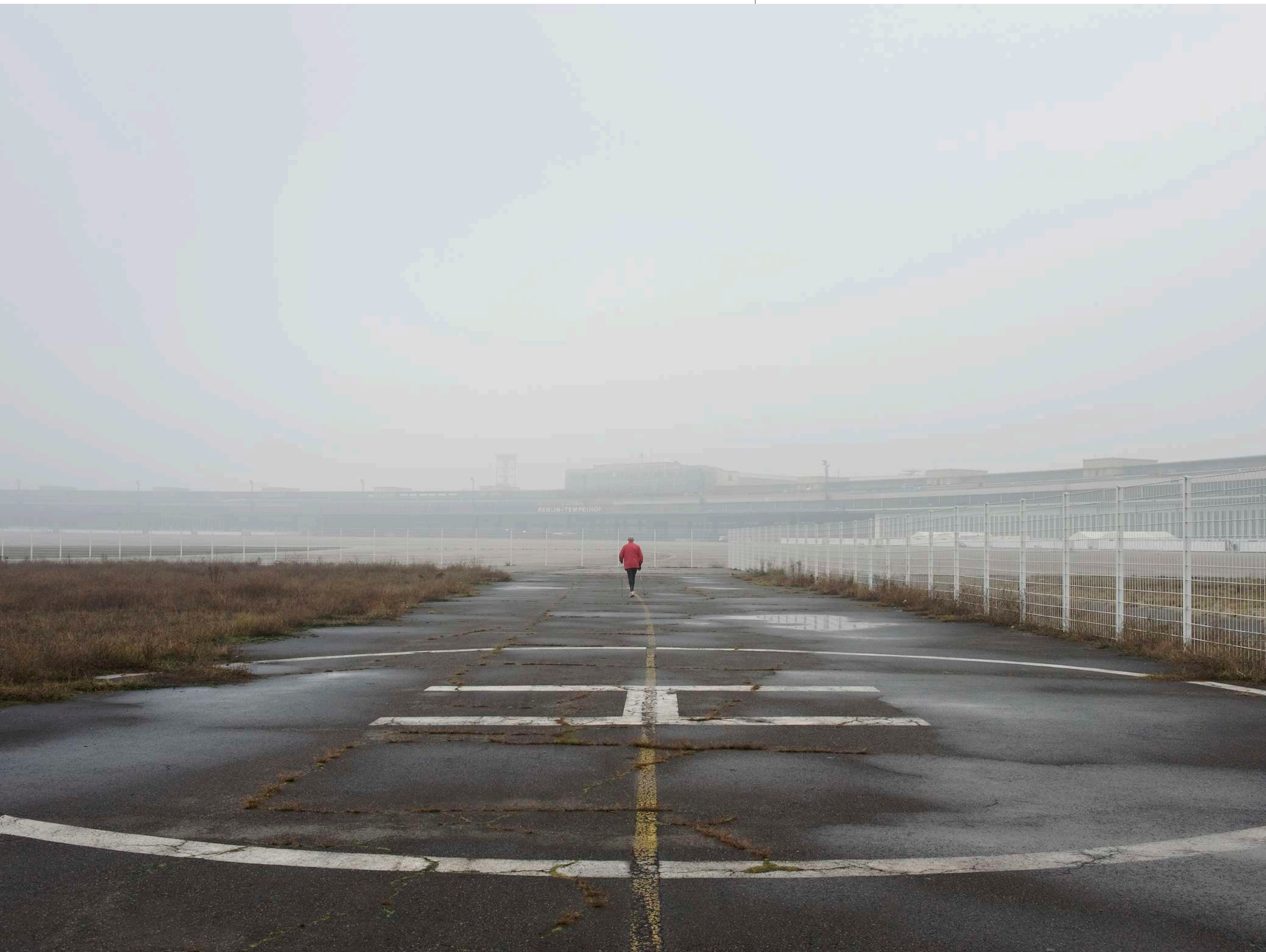
TEMPELHOF. METAMORPHOSIS #6626, BERLIN, 2016