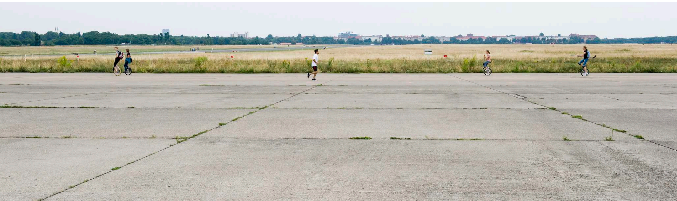
— TEMPELHOF. METAMORPHOSIS #4232, BERLIN, 2010