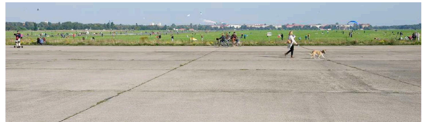
— TEMPELHOF. METAMORPHOSIS #6, BERLIN, 2011