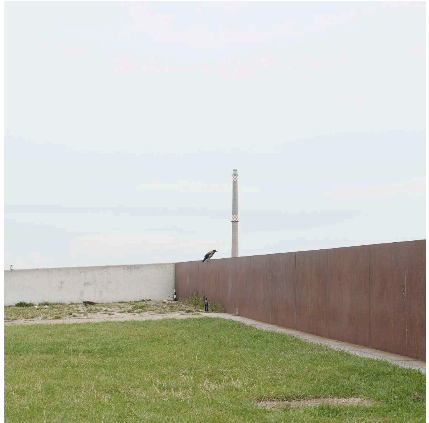
TIME OUT #9245, BERLIN, 2011

“Transitions are always challenging, but in most cases they also carry new freedom.”