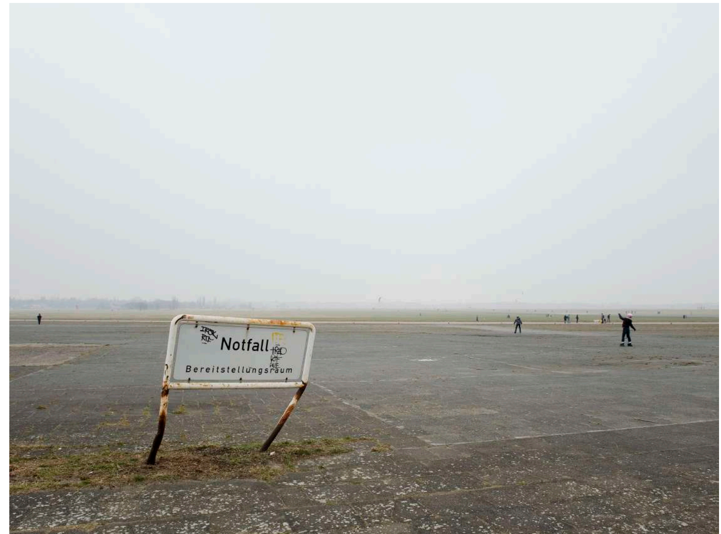
TEMPELHOF. METAMORPHOSIS #898, BERLIN, 2015 (‘NOTFALL-BEREITSTELLUNGSRaum’ = EMERGENCY PREPAREDNESS AREA)

Tempelhof Airport, renowned for its pivotal role during the Berlin Airlift of 1948/49, was completely shut down in 2008. By 2010, the airfield had been opened to the public, creating a unique urban space in the heart of Berlin. Thiele was enchanted by this magical place and felt compelled to document its transformation and appropriation by people and nature. Over countless walks with her camera, Thiele captured the vastness of the space, the dynamic interplay between human activity and natural elements, and the ongoing debates about its future utilization amidst Berlin's severe housing shortage.